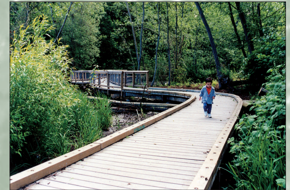
Carkeek Park, Seattle

Promote the continued greening of the Emerald City by completing the missing connections and creating new linkages in Seattle's parkway and boulevard system.